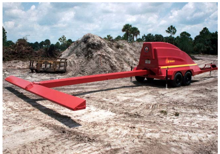
Figure 6—Trench burner.