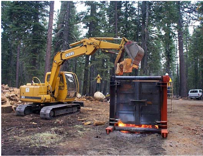
Figure 4—Loading fuel into ACD (full operation).

over the firebox creates an air curtain that traps unburned particulate until it is completely consumed. Nearly complete combustion is achieved with minimal amounts of escaped particulates, virtually eliminating smoke.