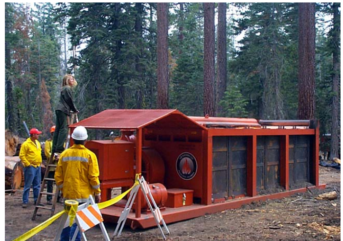
Figure 3—Skid mounted ACD in full operation (no visible smoke).

Skid-mounted systems are designed and constructed to optimize the air curtain concept. High velocity air is blown across and down at an optimum angle into the pit creating the air curtain on top and a rotational turbulence within the firebox. The high velocity air creating the rotational turbulence provides an oxygen-enriched environment in the combustion zone that accelerates the combustion process (similar to the effect of fanning a fire). The temperature within the firebox is usually above 2,000 °F. The high velocity air