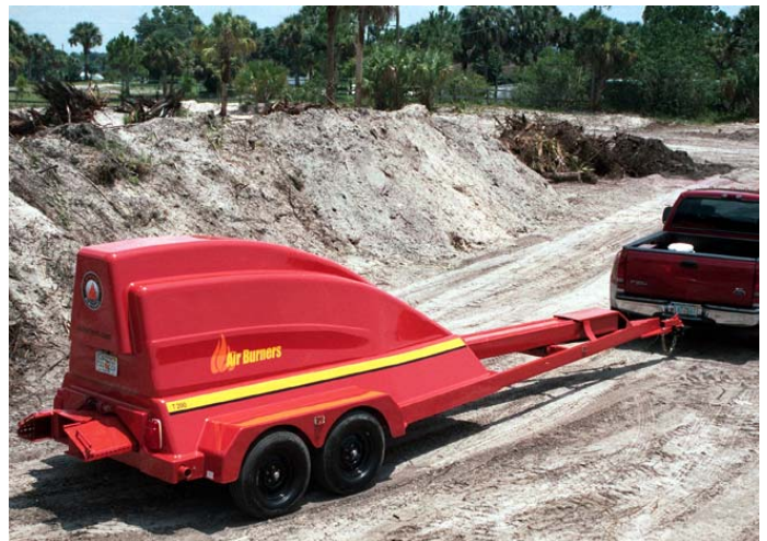
Figure 5—Trailer mounted trench burner system.

The self-contained firebox burners eliminate guesswork regarding the size of the fire area. These above-ground units avoid problems with the water table, rocks, and roots and allow for easier ash removal. The real minus for these units is their size. The smallest ACDs weigh over 20,000 pounds. So dragging it around in soft soil can be difficult. While the smaller units will fit on a