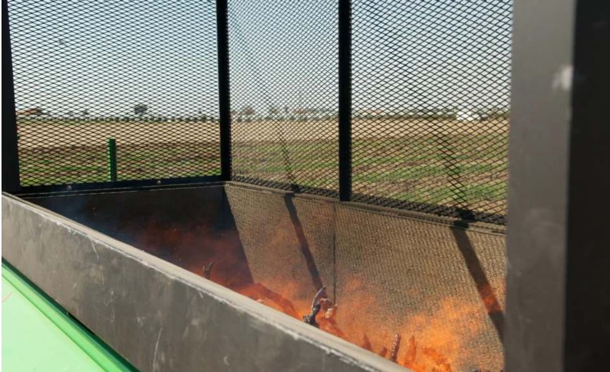
Fig. 2 BurnBoss® Air Curtain Burner with grape stumps

Fan speed was tested on the unit and it was determined that the tractor RPM speed should be no lower than 1,100 RPM after 5 minutes of material ignition, then increased to 1,500 to 2,000 RPM, to maintain the efficiency of the air curtain. The range of the RPM can be increased or decreased to control any flying ash, though this was not normally a problem, unless the paper is loose due to paper not bundled properly.