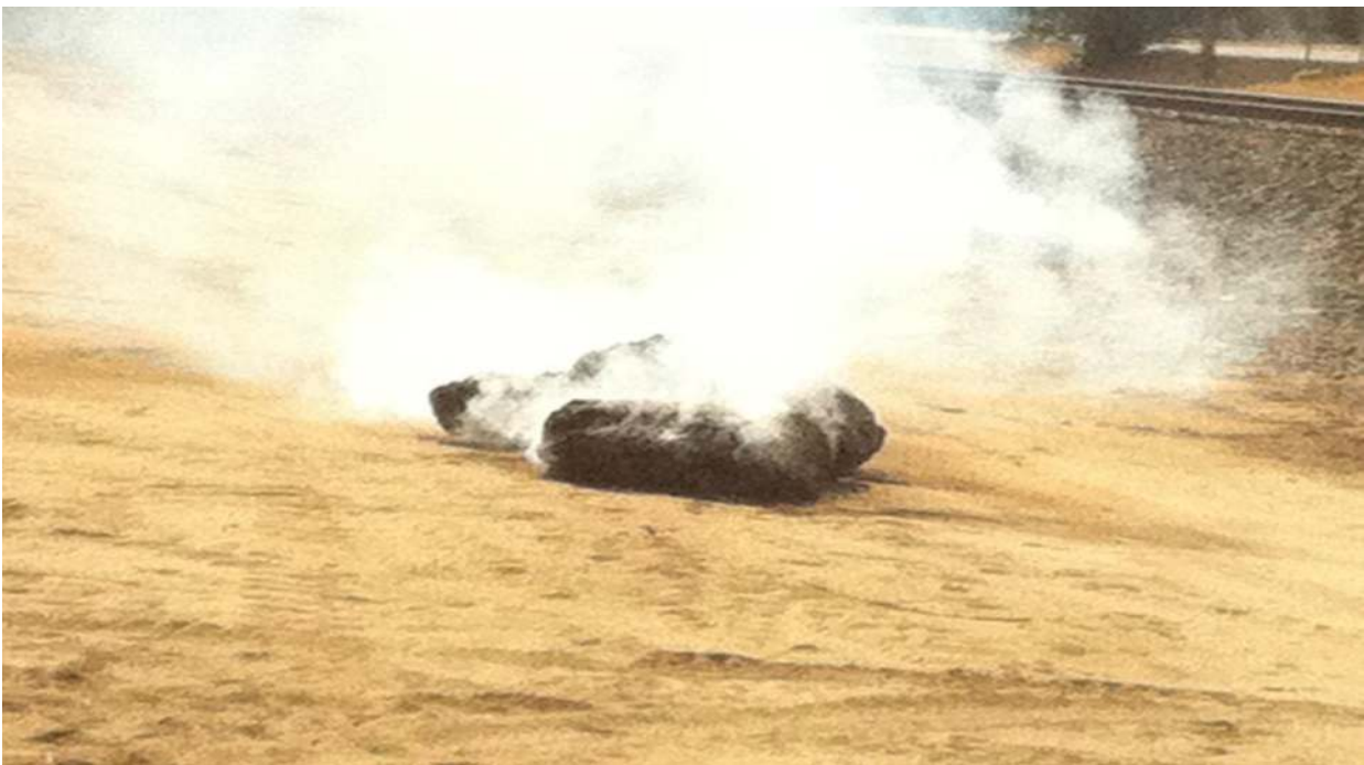
Fig. 5 Open Tray Burning