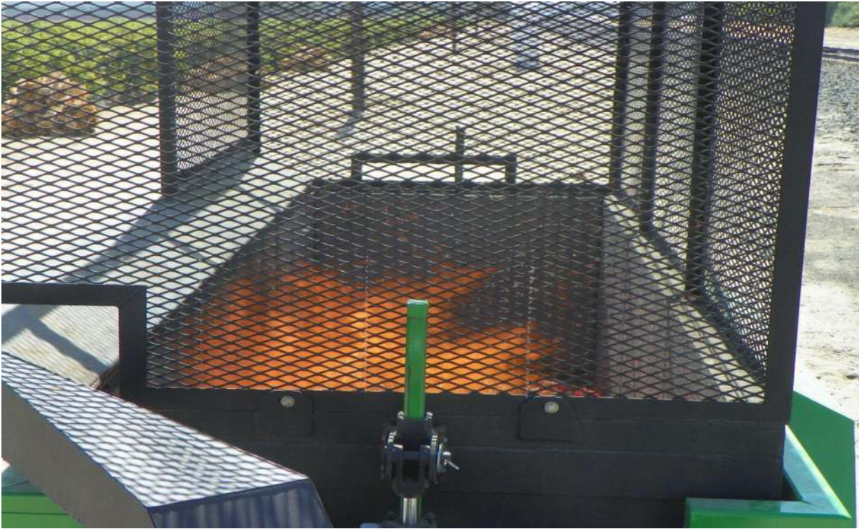
Fig. 4 Tray Burning in ACB