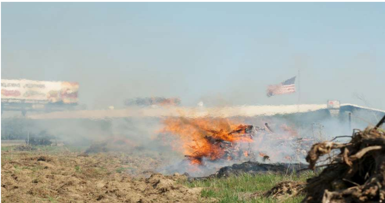
Fig. 1 Open Stack Burning