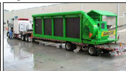
Drop-deck or Flatbed